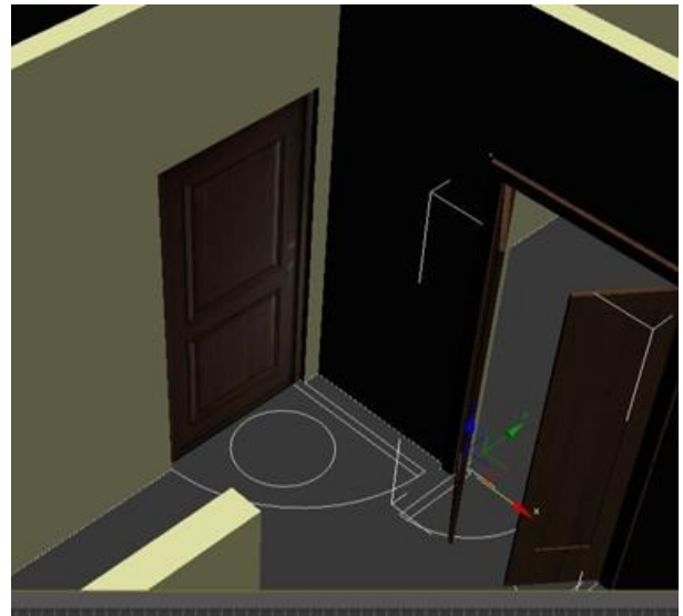
Figure 4. Doors