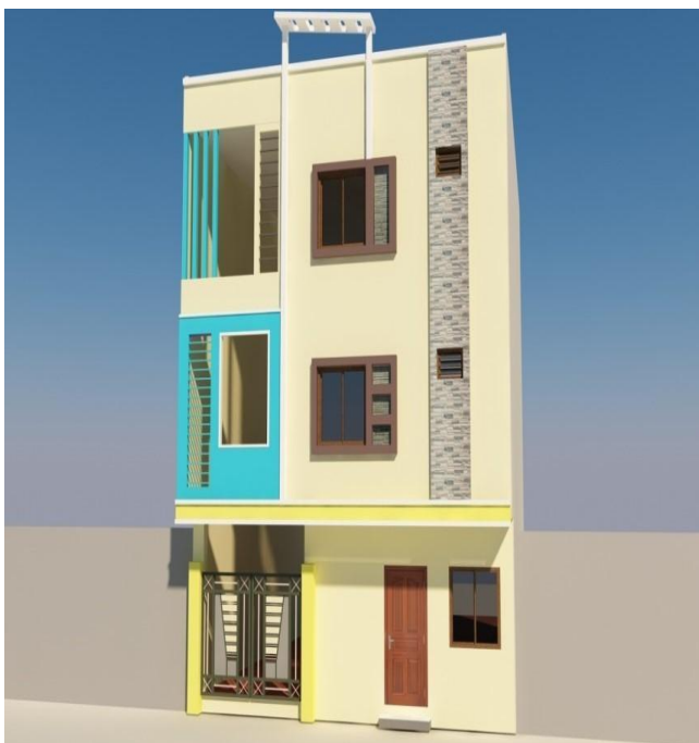
Figure 7. Exterior elevation of the G+2 villa