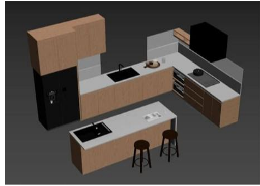
Figure 3. Kitchen