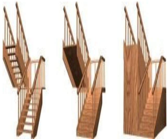
Figure 5. Stair case